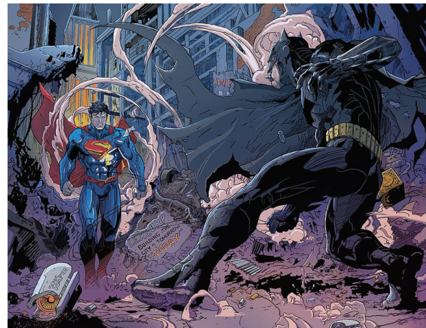
Jim Lee for DC Comics